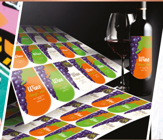
CONTOUR CUT LABELS